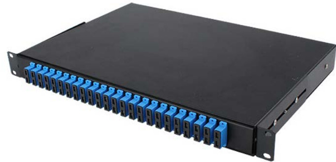
19" Patch Panel upto 48F

AFOC fiber optic patch panel (FOPP) Series are used to terminate network or equipment cables for FTTH, WAN & Industrial Networks. The patch panel connects fibers coming from one or several network cables to connectors.